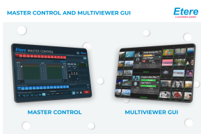
ETX and Multiviewer