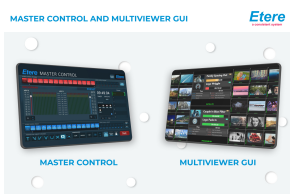
ETX and Multiviewer