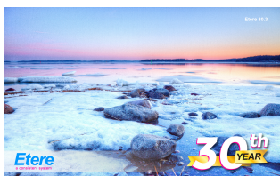
Etere 30.3 wallpaper

Adaptability and future scalability are important considerations when it comes to choosing a system for your business needs. Indonesia's state-owned TV station, Televisi Republik Indonesia (TVRI) upgrades to Etere 30.3 to tap on the latest innovations and to optimise the performance of their broadcast system. The station has been on-air with Etere since 2005. Etere empowers TVRI with a system driven by fully-customisable workflows, enabling their system to be perfectly in tune with their business and operational needs. As part of its customer support contract, Etere provides unlimited software upgrades and updates to meet evolving industry challenges. With a quick and easy software download, you can ensure your system is always ready to run with the latest features.