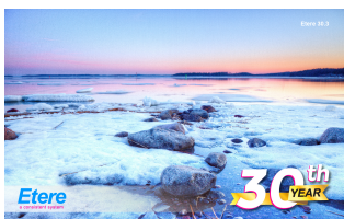
Etere 30.3 wallpaper