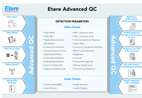
Etere Advanced QC