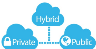
Cloud storage solutions

Etere integrates seamlessly with Microsoft Azure Cloud for secure, fast and flexible file transfers, content distribution, file sharing and offsite backup. Etere continuously provides value with its flexibility, interoperability and simplicity of data integration. Etere's tight integration with Microsoft Azure allows you to access the cloud storage directly without third-party tools, drivers or software. The integration includes customising multiple levels of user permissions or setting up a virtual directory available to all users. Etere provides maximum flexibility to users to ensure a perfect fit for their environment.