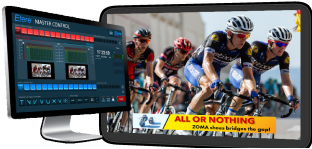
Channel in a box Etere ETX

Etere ETX integrates Picture-in-Picture (PIP) capabilities with a user-friendly interface to unleash the infinite potential of next generation content delivery.