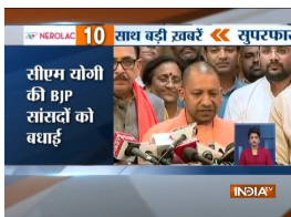
Picture in picture