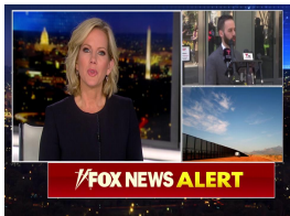
Picture in Picture Etere Automation