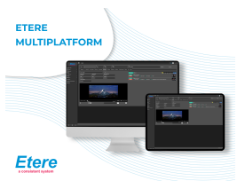
Etere Web Multiplatform

Released as part of a global initiative, Etere is now available in Arabic GUI for an enhanced experience for users from all around the world. The new GUI is available on both the Etere Web and desktop application.