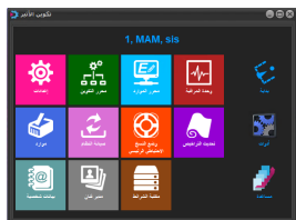
MAM Arabic GUI

As part of software GUI enhancement initiatives that are progressively released this year, Etere GUI is now available in Arabic language to support users from all around the world. All users on a valid support contract can access this language selection from the profile preference tab. Etere's investment in research and development continues to spearhead digital innovations for the future and to help users achieve competitive advantages. Besides English and Arabic, Etere GUI is also available in French and Russian GUI, with more languages being rolled-out progressively.