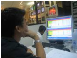
Etere for Shin Satellite

Its services help companies and governments broadcast television, connect to the Internet via satellite or link communications among countries under the Thaicom footprint, which covers Asia, Australia, Africa, the Middle East and most of Europe. Shin Satellite offers teleport facility to different station.