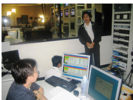
Shin Satellite system

We remember that this is second ETERE's installation in Thailand, after CH3, with Sony Thai.