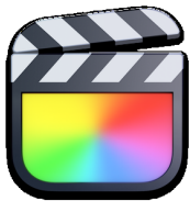
Final Cut Pro

With the seamless integration between Etere Ecosystem and Final Cut Pro , content editors can access the professional editing, color, effects, and audio post-production video editing software directly from the Etere interface. With a login, every user can see all available assets and start connecting with Etere database.