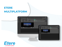
Etere Web Multiplatform

Etere Media Asset Management (MAM) manages the complete media cycle covering ingest, transcoding, content retrievals, metadata association, and asset distribution. It is a complete software solution running on Commercial-Off-The-Shelf (COTS) hardware. Besides a Windows-compatible application, it is also available as a web platform accessible on any internet browser. Etere MAM features automatic ingest and quality control workflows. It can generate multiformat, multipurpose files for delivery to multiple platforms. In addition, the integrated MD5 checksum feature ensures data integrity even after file movements and asset versioning.