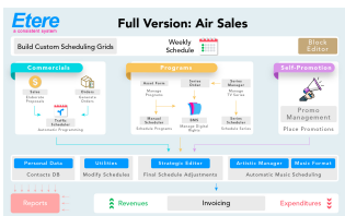
ETERE AIRSALES diagram

Etere Airsales Web is now available online with a new interface encompassing functionality and convenience. With a secure log-in from any internet browser, you have more efficient performance, faster speeds, and enhanced security. This software upgrade is free for all Etere users with a valid support contract. Etere Web supports HTML5 plugins, the latest HTML release. It also supports HTTPS to ensure the benefits of secure encryption, better performance, and faster speeds.