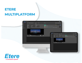
Etere Web Multiplatform

■ Etere Resource Management enhances operational efficiency by integrating video, processes, and resource management. It features real-time monitoring and optimizes the use of resources.