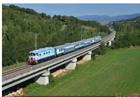
Local railway network

O.M.S. Ferroviaria S.r.l. is an Italian company in Tuscany that manages the media and entertainment systems of the local railway network. It announces the implementation of the Etere Ecosystem to streamline workflows and enhance operational efficiency.