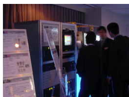
FOR-A Open House

Etere and FOR-A distributor partner announce the big success for Japanese Open-House