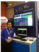
Etere NAT EXPO 2012

The 3-day event on 6/8 November brings a lot of new opportunities to Etere. At NATEXPO, Etere has renewed the success of its products in the Russian market being proudly supported by SVGA, its local distributor. At the stand it has captured all broadcasters' attention.