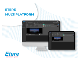
Etere Web Multiplatform