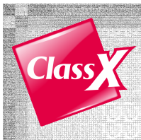
Class X Logo