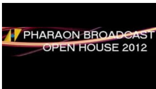
Pharaon Broadcast Open House company logo