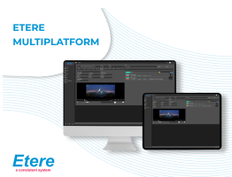
Etere Web Multiplatform

Etere Media Asset Management (MAM) is a fully scalable and flexible software that helps you to manage video and multimedia files more effectively. Etere MAM goes beyond the traditional file movement technology to give you a competitive edge, enhanced security, and higher cost efficiency when sending and sharing files anywhere in the world. In addition, Etere's customizable automated workflows help you to accomplish tasks with maximum accuracy and minimum effort. The effective implementation of Etere MAM increases operational efficiency and maximizes the return on investment of digital media.