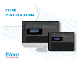
Etere Web Multiplatform

With its seamless interface and collaborative software tools, Etere VOD Management is one of the most versatile tools for managing cross-platform content delivery and audience engagement needs. On a single interface, you can have all the features you need to manage your end-to-end workflow without using external XLS file systems and other manual operations to effectively monetize your VOD content to multiple platforms.