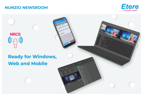
Integrated Nunzio Newsroom