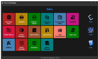
Main Menu 23

The new Etere release shows a complete redesign of it's GUI. The product is now more easy to use and with the best GUI of the market