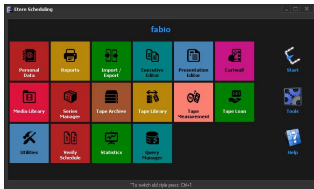
Main Menu 23

The new Etere release shows a complete redesign of it's GUI. The product is now more easy to use and with the best GUI of the market